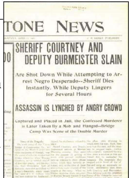
Above: Mondak newspaper, April 12, 1913.