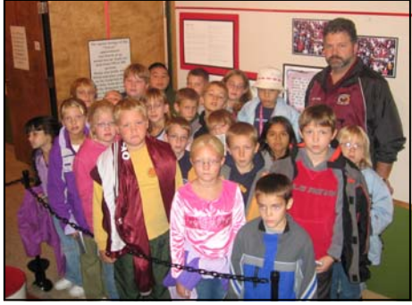
Sidney fourth grade class tours the Schindler Exhibition.

Hosting the Schindler Exhibition was two things: 1) Challenging to do and 2) Highly successful. The MonDak Heritage Center Staff, Volunteers and Board of Directors are very grateful for both.